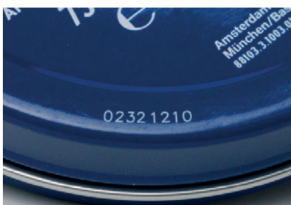
Writing on painted tins