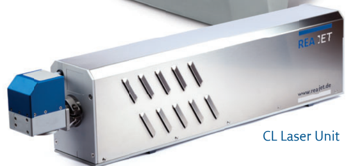
CL Laser Unit