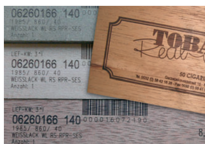
Marking of wooden profiles