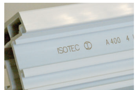
Marking of plastics