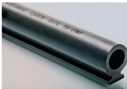
Marking of rubber profiles