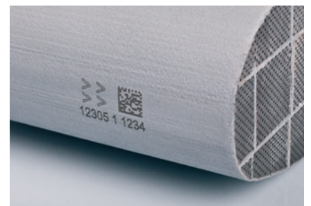
2D-Code marking of soot particle filters