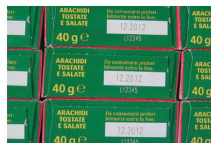
Writing on cardboard boxes