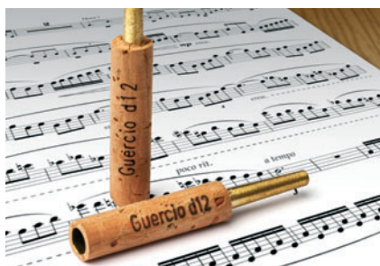
Writing on cork