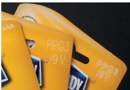
Writing on card