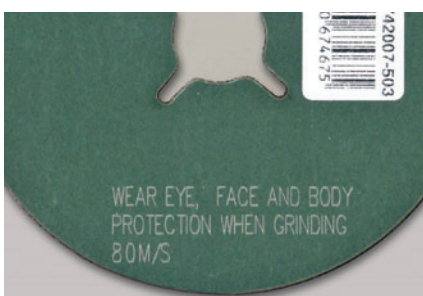
Writing on sanding discs